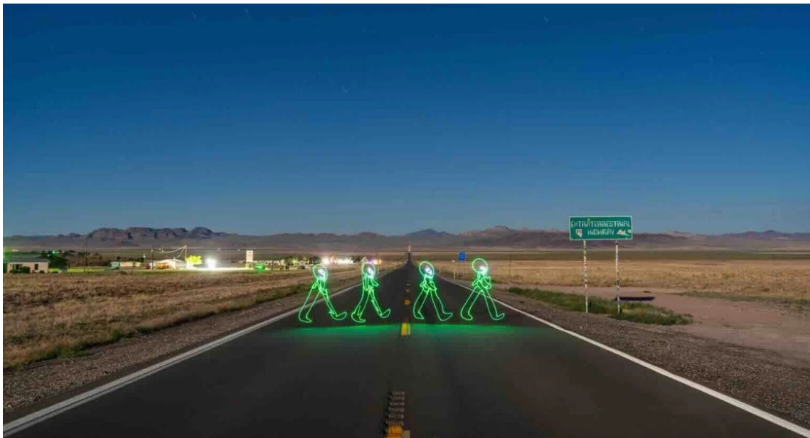
Could not resist! (See "Neon in Nature" below)

Man brings cup of water to Hoover Dam; Is it true water refuses to go in?