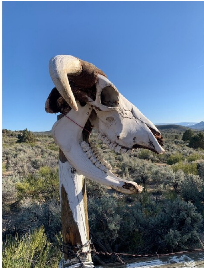
📸 A ranch-gate guardian straight out of the Wild West, perched off Ax Handle Rd amid the breathtaking high-desert expanse of Palomino Valley, NV. Keep it wild! —Fauna T. ❤️

Submitting an Award-Winning NSBW Nomination