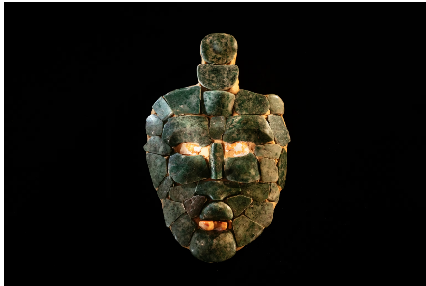
The Maya Storm God—and 6 other stunning archaeological finds in 2024

Environmental groups demand EPA to start monitoring microplastics in water