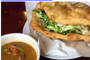
10 Phoenix, Arizona Fry Bread House

One of the city's few vendors selling the Sierra Norte's ancestral beverage lies within a hidden farmers market.