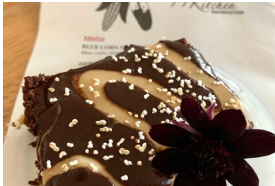
19 Oakland, California Wahpepah's Kitchen

This café is dedicated to serving coffee roasted by Native American-owned companies.