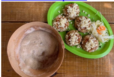
9 Oaxaca, Mexico La Pozontlería

A museum cafe showcases Native American dishes and indigenous ingredients from across the Western Hemisphere.