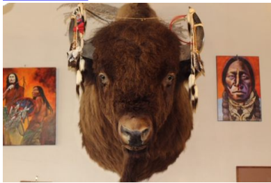
18 Portland, Oregon Bison Coffeehouse

Where else would a linchpin of post-colonial Native American cuisine anchor the menu but a museum?