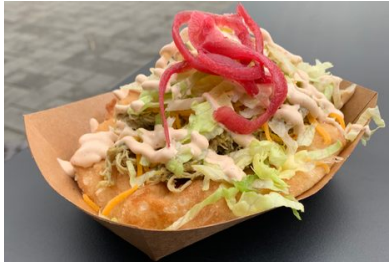
17 Seattle, Washington Off the Rez Cafe

Named for the 39 tribes that live in Oklahoma, this restaurant's menu deliciously highlights local flavors.