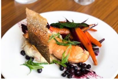
6 Calgary, Alberta Little Chief

At a hotel on Tsuut'ina Nation land, an Indigenous chef serves up smoked bison poutine and other fusion favorites.