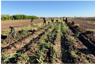
7 Tucson, Arizona San Xavier Co-op Farm

At a hotel on Tsuut'ina Nation land, an Indigenous chef serves up smoked bison poutine and other fusion favorites.