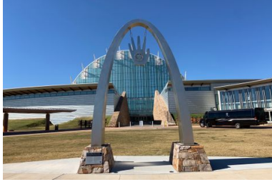
16 Oklahoma City, Oklahoma Thirty Nine

Named for the 39 tribes that live in Oklahoma, this restaurant's menu deliciously highlights local flavors.