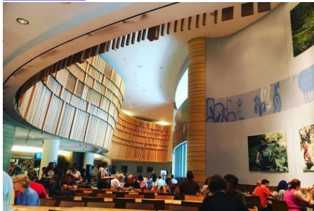
8 Washington, D.C. Mitsitam Native Foods Cafe

Run by members of the Tohono O'odham Nation, this community farm nurtures traditional desert cultivars.