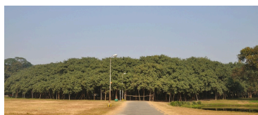
THIS IS NOT A FOREST, BUT A SINGLE TREE IN INDIA. IT SPANS 4.67 ACRES, IS 80 FEET TALL AND OVER 250 YEARS OLD!

Growing out of the trunk of this oak tree is an albar pine. Both trees are alive and have been growing together for more than 100 years. The pine is 15 meters tall and 130 years old, while the oak is 12 meters tall and 250 years old.