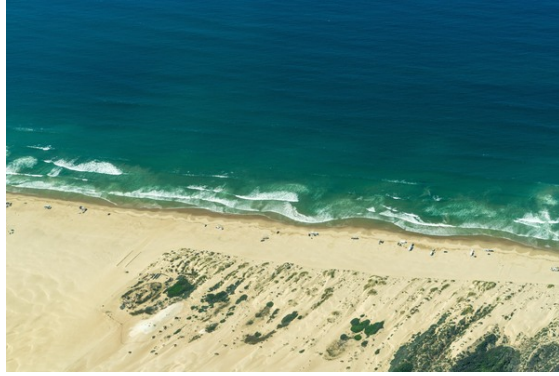
Aerial photo of the proposed CHNMS | Oceano Dunes

We brought along a select group of media and friends for this very special preview aerial tour of the new Sanctuary, and we're thrilled to share that our event received some great coverage from a few local news outlets. The SLO Tribune featured us in an article called, " See the proposed Chumash Heritage National Marine Sanctuary from the air. 'It's pretty special' ," and they even included an awesome video of the flyover!