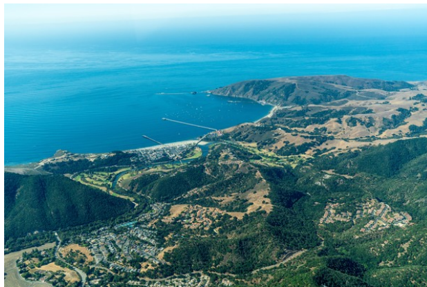
Aerial photo of the proposed CHNMS | Avila Beach

On September 17th & 18th, the Northern Chumash Tribal Council joined forces with EcoFlight , a Colorado-based 501c3 nonprofit that offers its partners a unique aerial perspective of public lands, resource management, and environmental issues. Flights showcased spectacular sights, including Morro Rock (Lisamu), Morro Bay estuary (Tsítqawí), the bluffs of Montaña de Oro, Avila Beach (Tsipxatu), and the Guadalupe-Nipomo dunes. Participants were guided by NCTC's extraordinary Tribal Cultural Resource Monitor, Ernest Houston, who offered insight into the cultural and ecological significance of the region we're working to protect!