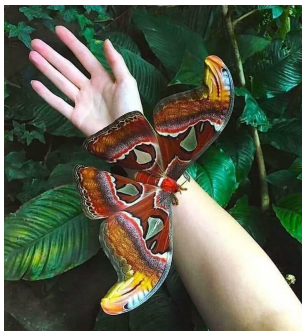
Attacus Atlas, one of the greatest night butterflies in the world.