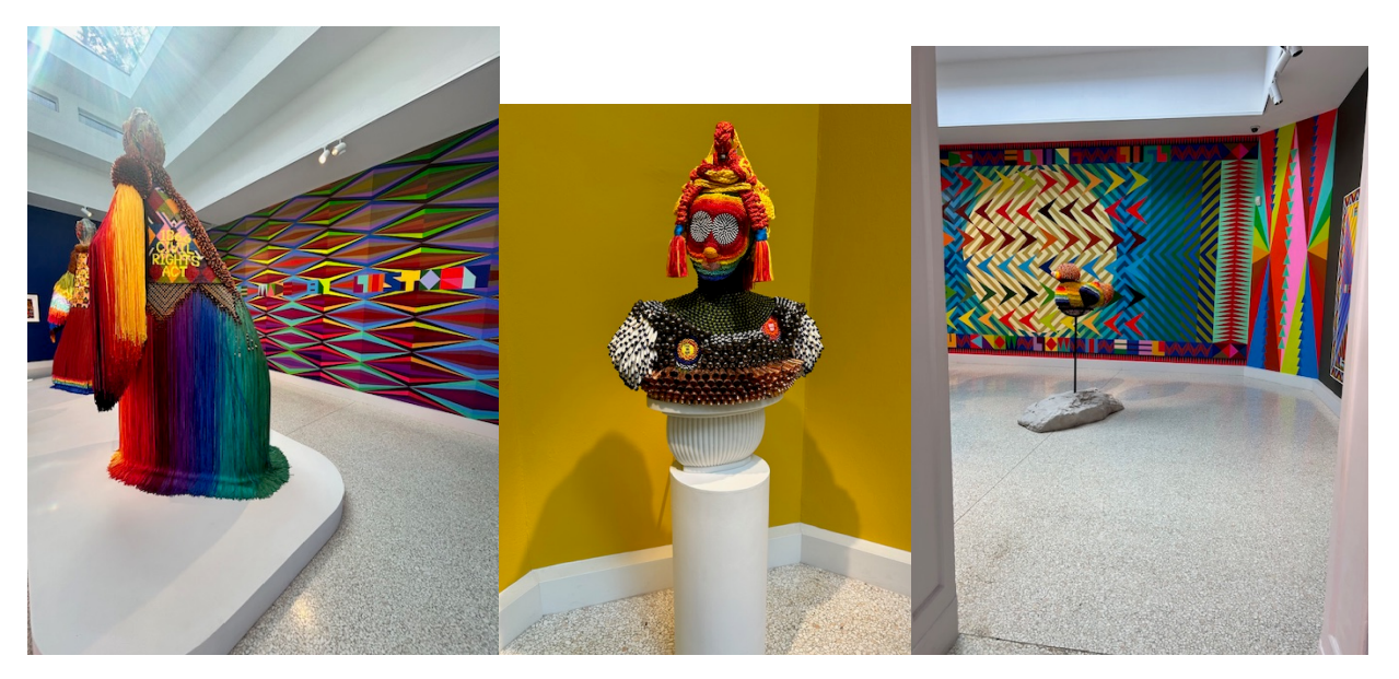
La Biennale di Venezia Ca' Giustinian, San Marco 1364/A