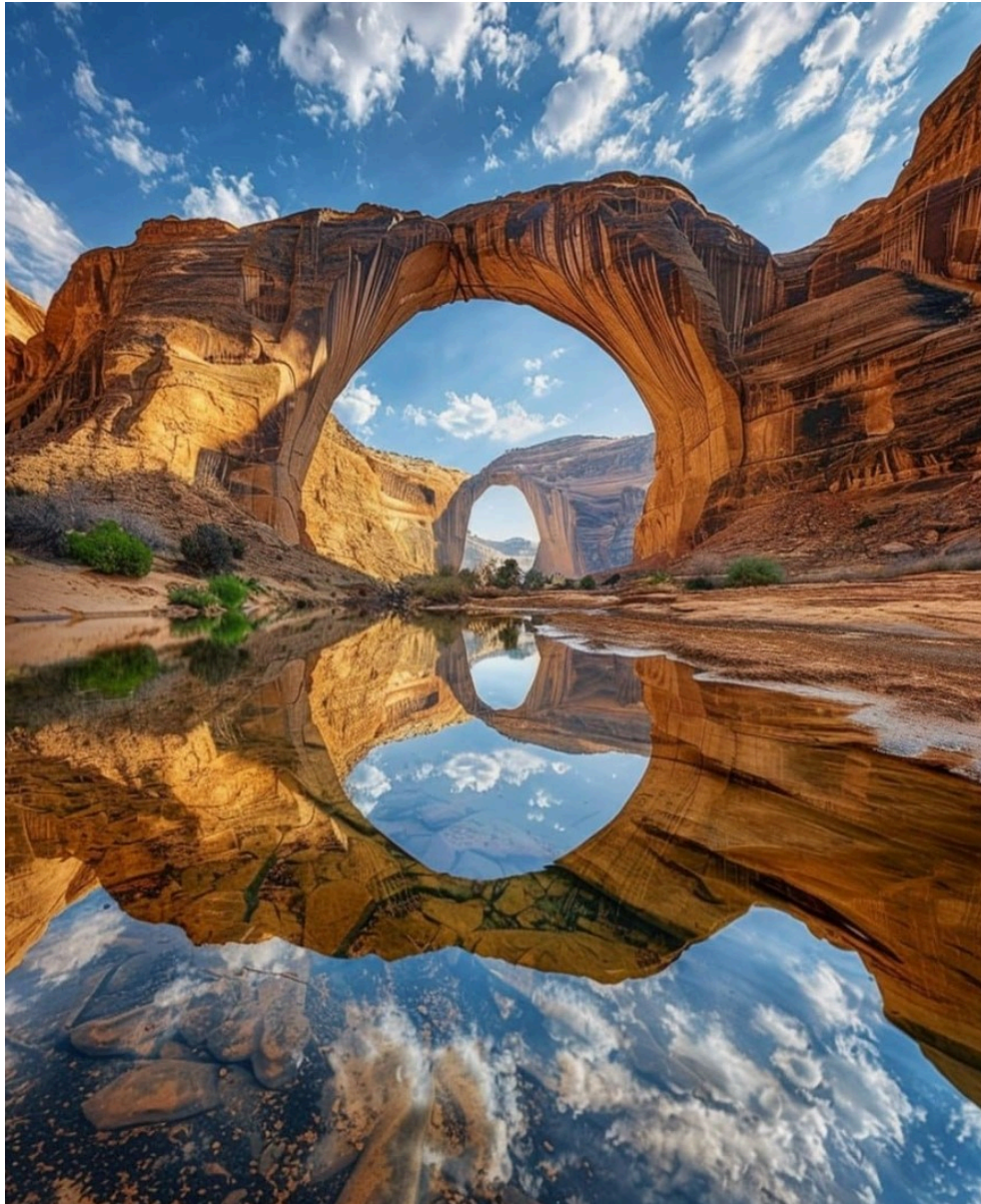
A stunning arch reflection in the crystal clear waters of rainbow bridge at arabian desert, Utah

Second-Fourth State of the Union Addresses by President James Buchanan