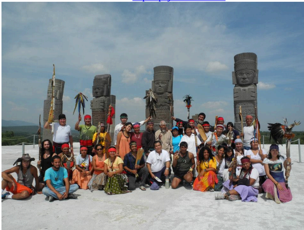
Peace and Dignity Journey running through Center of Country with Prayers