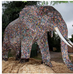
Beautiful Planet Earth Life-sized elephant statue made from 29,649 old batteries.