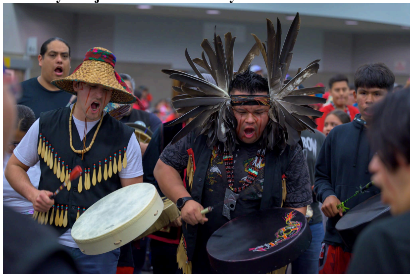
Unity Conerence in Portland