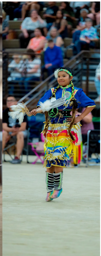
'Tis the Season!