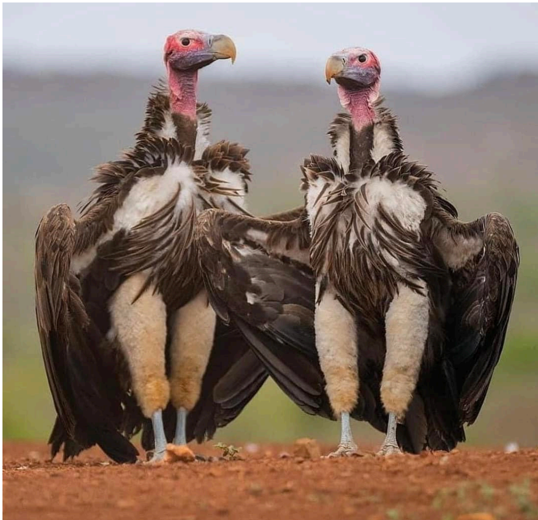
Two Lappet-faced vultures showing off their legs