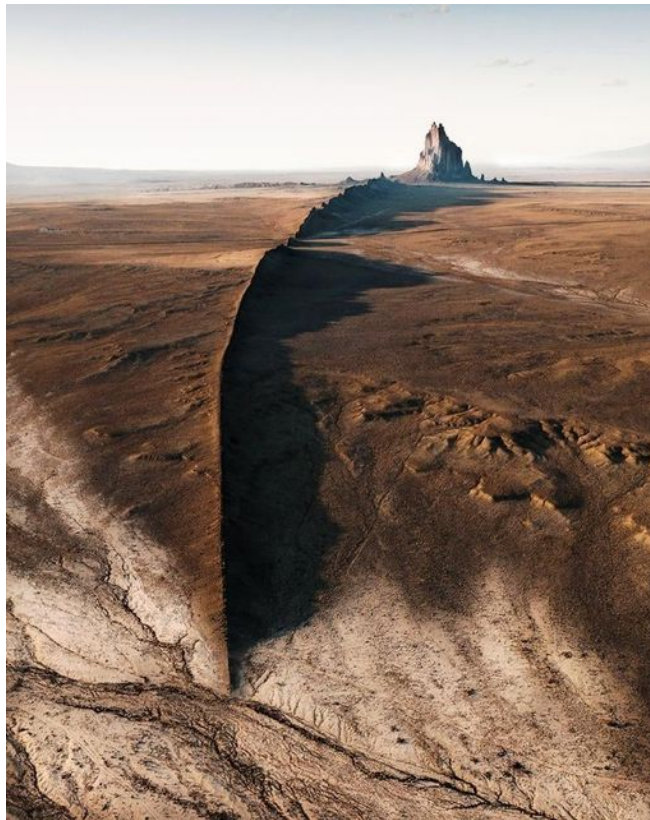
GemHunter · Ship Rock, NM