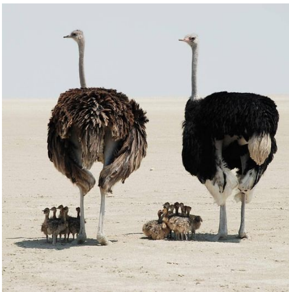
Ostrich family trip!

The Native American Agriculture Fund (NAAF) is partnering with National Agriculture in the Classroom to offer scholarships to teachers of Native American ancestry or Native American students to attend the 2021 NAITC Conference “Fields of Dreams” scheduled for June 28-July 1 in Des Moines, Iowa. The scholarship covers early registration of $435 and travel to the conference. Eligible applicants are teachers at a Tribal government operated school, a Bureau of Indian Education (BIE) school or a BIE-supported school; a school on a reservation teaching Native American students, a non-reservation school that has a high percentage of Native American students, or teachers with a Tribal affiliation. The deadline for applications is April 15, 2021.